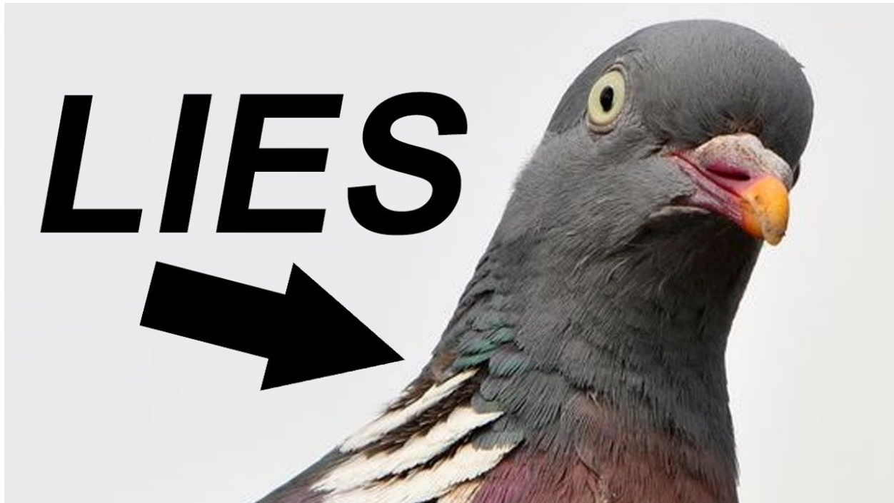
Fig. 1 Big Picture of Fake Bird to Fill Empty Space on Abstract Page.

Abstract: Birds are not real. And I have sources to prove it too.